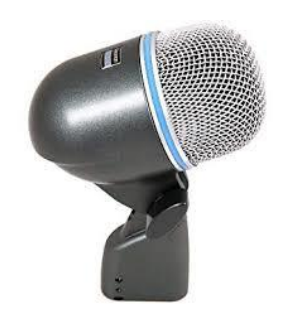
Shure Beta A52

Kick Drum (Electric Bass Amplifiers) Super Cardioid Frequency response shaped specifically for kick drums and bass instruments, Supercardioid pattern for high gain before feedback and superior rejection of unwanted noise