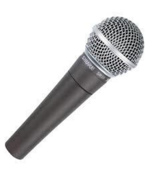
Shure SM 58

Vocal/Speech mic, uniform cardioid pattern